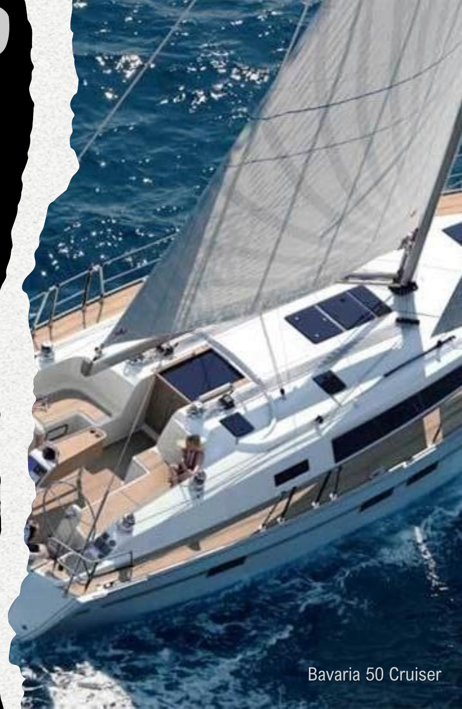
Bavaria 50 Cruiser